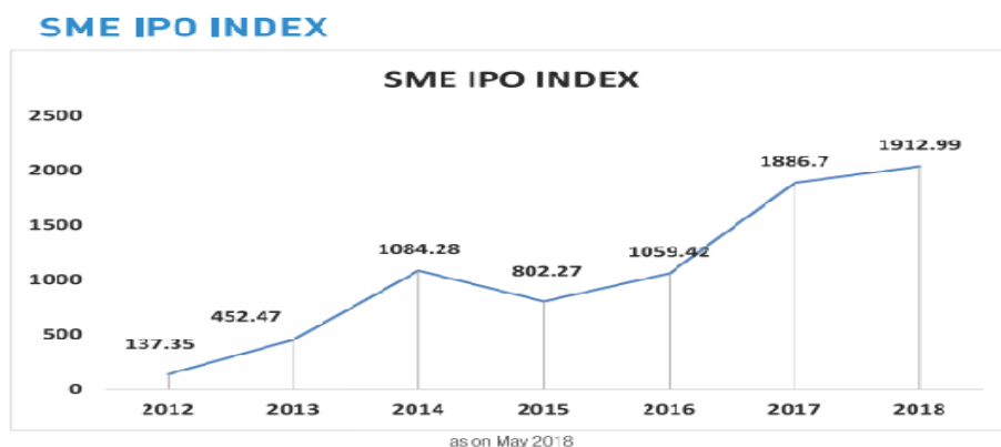
Figure 2 Fund raising and sectorial distribution

Issue of securities in an IPO is, governed and regulated by SEBI (Disclosures and Investors Protection) Guidelines, 2002 – prominently known as the SEBI DIP Guidelines, which gives that an company which has applied can pull back applications in an open issue. Be that as it may, note that according to the SEBI DIP Guidelines, Qualified Institutional Bidders (QIBs) are not actually permitted to pull back their offer after the offer conclusion. This standard was set to forestall any conceivable control of the IPO membership by the QIBs. Initial public offering application might be pulled back by a candidate company by composing a letter on the same, to the Registrar of the issue, featuring the Company's name and unmistakably referencing total application number, names as in the application and marks everything being equal.