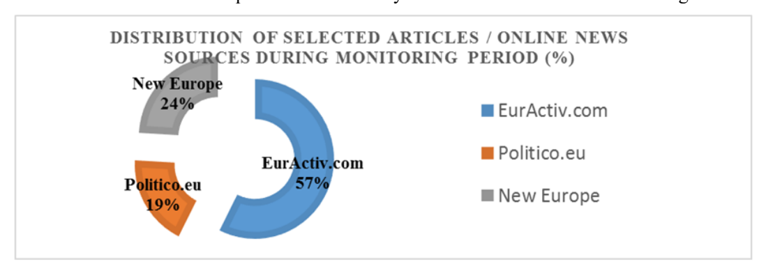
Figure 2. Distribution of selected articles / online news sources during monitoring period (%)

This section fulfills the following objectives: (1) presenting and discussing the results of media monitoring in terms of qualitative analysis on the statistical distribution of selected articles per online news sources during monitoring period, (2) showing the thematic distribution in selected articles during monitoring period, and (3) presenting the results of the qualitative analysis on news framing.