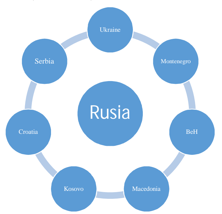
Figure 2. Russia spider diplomacy: Authors' own compilation

Ukraine's ambassador to Serbia, Oleksand Aleksandrovych, stated: "Russia is training Serbian mercenaries to kill in Ukraine. Russia is using Serbian extremists to make a coup in Montenegro. Russia Encourages Serbian separatism (Bosnian Serb-dominated entity) in Republika Srpska to destabilize Bosnia and Herzegovina. Russia is using the Serbian factor to destabilize Macedonia. Russia is playing an active role in countering Kosovo Serbs against Albanians in Kosovo. Russia is selling arms to Serbia to create tensions with Croatia. (Zivanovic, 2017).