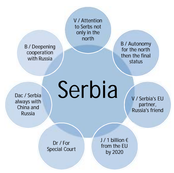
Figure 3 Serbia spider diplomacy: Authors' own compilation

Ana Brnabic, Serbia's prime minister, then stated that a dialogue on autonomy for northern Kosovo needs to be discussed and then talks on the final status of Kosovo, and if Serbia is obliged to choose between the EU and Russia, it will choose the EU -in. (Savic, Filipovic, 2017).